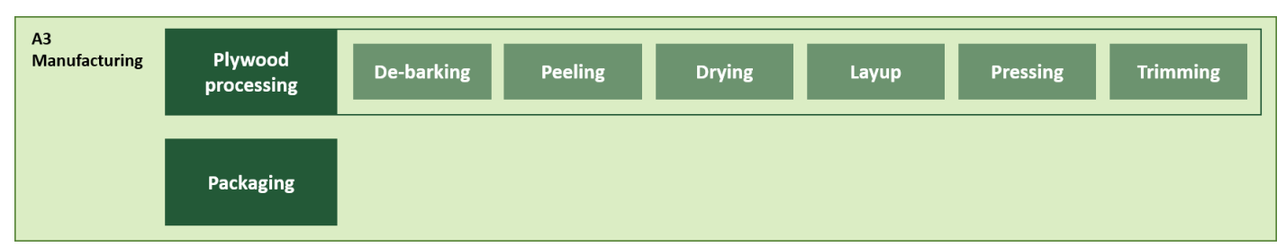
Figure 2. Softwood plywood manufacturing process

Logs are cut to length and debarked on the log yard, before the logs are conditioned with hot water or steam. Then, logs are peeled in the lathe to make veneer. Veneer is clipped to size and sorted by moisture content. Veneers are dried to 4-6 %MC. The resin is applied on the veneers, and the veneers are cross-laminated in a mat, and the mat is pressed. Finally, the plywood panels are sawn to appropriate dimensions.