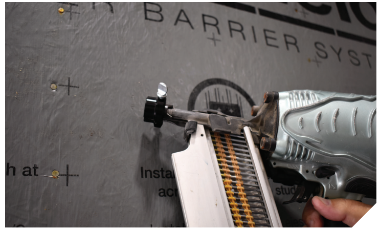
01 NAIL GUN WITH FLUSH MOUNT COLLAR ATTACHMENT