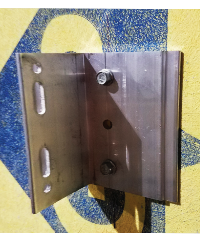
Eco Cladding brackets