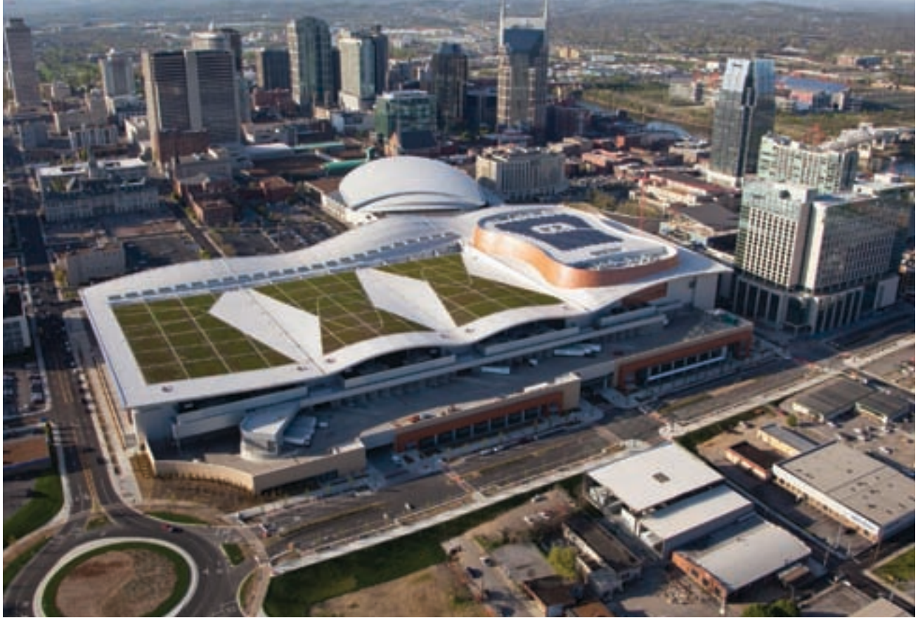
Large solar array on the Music City Center, Nashville, TN.

U.S.A. – Georgia-Pacific Gypsum LLC Canada – Georgia-Pacific Canada LP