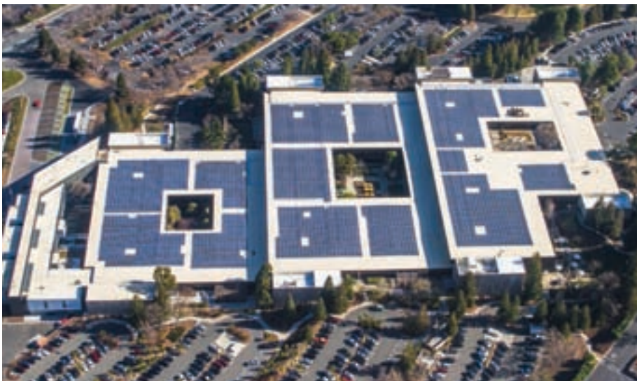
Hewlett-Packard Global Operations Headquarters—Sika Sarnafil® EnergySmart Roof® membrane over DensDeck® Prime roof boards, among other components, in 300,000 square foot re-roof project. Solar panels cover 85% of the roof surface.

However, the frequent need for solar roof inspections and maintenance means that the amount of foot traffic on these systems may be far greater than the traffic generated by an occasional piece of HVAC equipment on the roof.